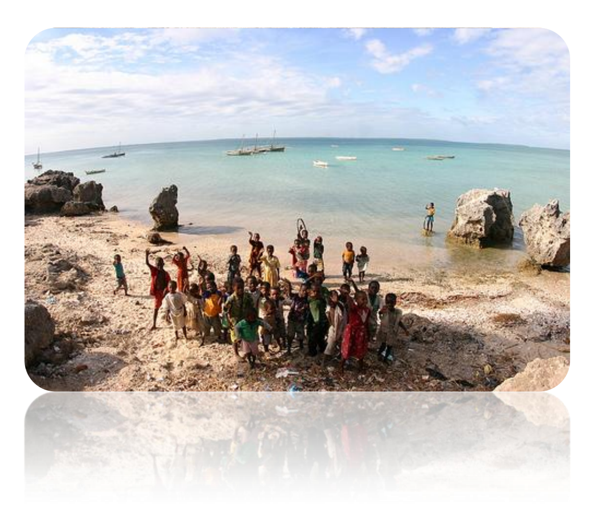
Crowd of Children on Jibondo Island

+255 773 257 327 / +33 9 7476 3038 info@tanzaniayachts.com http://www.tanzaniayachts.com