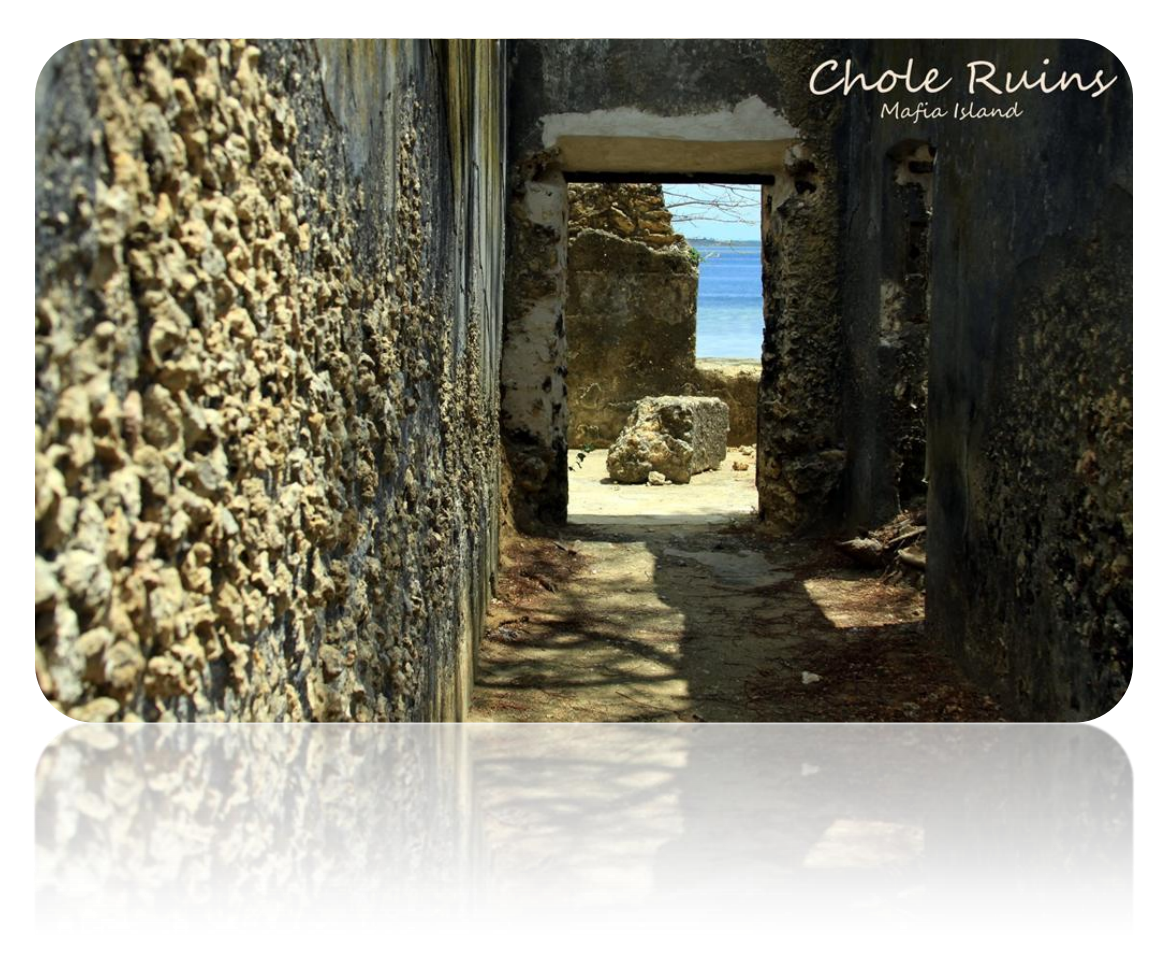
Ruins on Juani Island

+255 773 257 327 / +33 9 7476 3038 info@tanzaniayachts.com http://www.tanzaniayachts.com